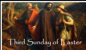
Third Sunday of Easter